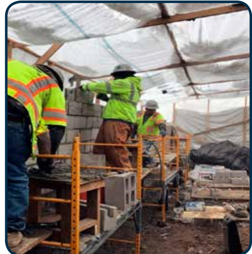
Brookwood sound wall under construction

grade, or incline, of the road, to improve visibility and overall safety for motorists traveling throughout the corridor.