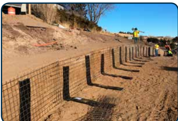
Excavation to prepare for retaining wall installation on Woodmen Road