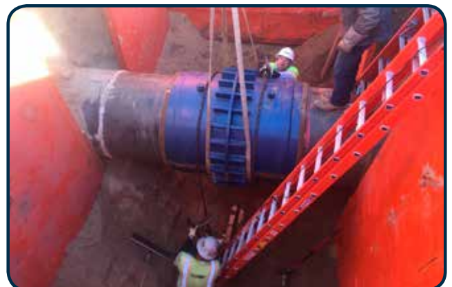
Installation of 42" water line

In late February, crews will complete the installation of a 42" waterline, (continued on other side)