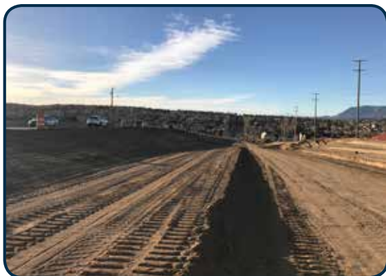
Excavation along Union Boulevard to reduce road grade

North of Woodmen Road, along the west side of Union Boulevard, crews have begun excavation work, removing up to 14 feet of dirt in certain locations. This excavation work is required to reduce the