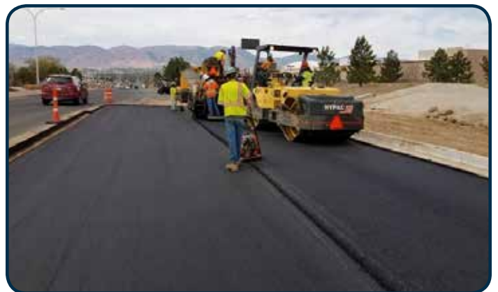
Roadway paving on westbound Woodmen Road