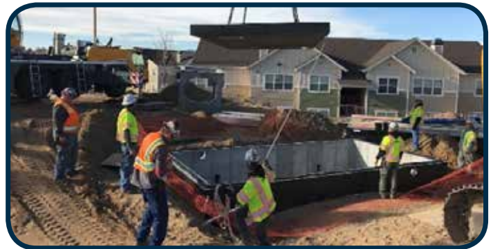
Crews installing lid on new waterline vault on Woodmen Road