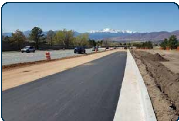
Newly paved roadway, curb and gutter on Woodmen Road

Email: WoodmenRd@PublicInfoTeam.com Phone: 719-900-5960