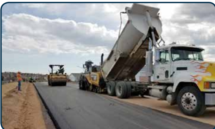
Paving of Bluebell Hill Drive